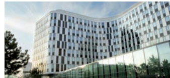
Hotel Courtyard by Marriott Schönbrunn