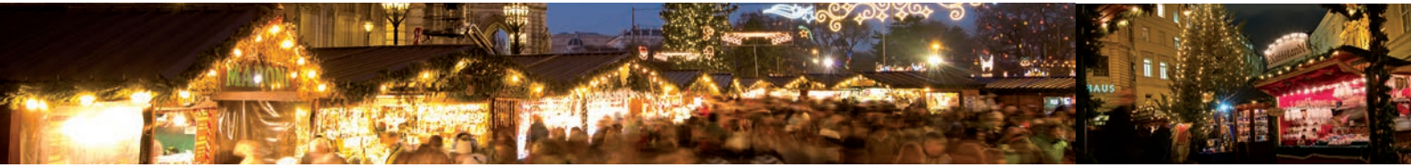
Left-to-right: Christmas Market in front of the Rathaus © Christmasmarket.at; Chestnuts at the Altwiener Christmas Market © Christmasmarket.at