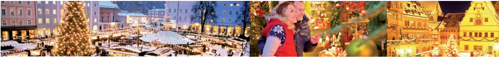
Left: Salzburg Christmas Market,