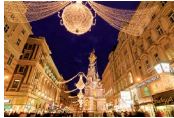
The Graben during Advent

This package is not to be used in conjunction with any other offer.