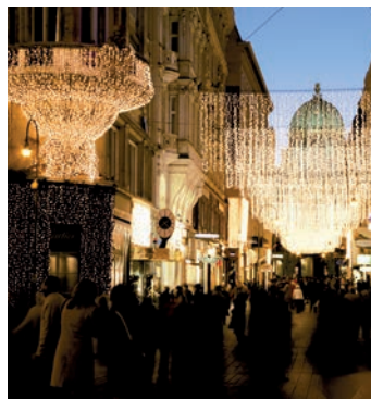
Vienna during Advent