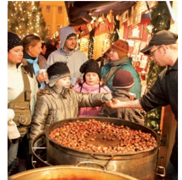
Chestnut stand

This package is not to be used in conjunction with any other offer.