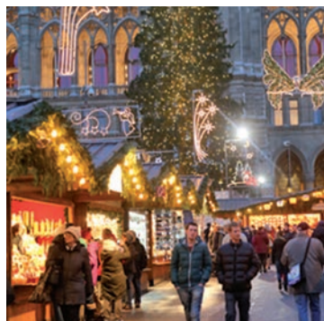
Christmas Market in front of the Rathaus

Explore the sights of Austria's Baroque capital, Vienna, which for centuries was the centre of the splendid Habsburg Empire. The city remains infused with the grand Imperial spirit in the form of magnificent palaces and grand mansions surrounding the Innere Stadt. The city's cultural heritage is mainly musical, the great composers like Beethoven, Brahms, Haydn, Mozart, Schubert and Strauss all having lived and performed here. Vienna is a city of music, home to the Vienna Boys' Choir but it is also synonymous with gourmet fare, cakes, coffee and the Lippizzaner stallions at the world-famous Spanish Riding School.