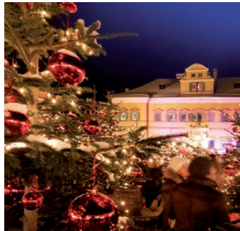
Hellbrunn Palace during Advent, Salzburg

This package is not to be used in conjunction with any other offer.