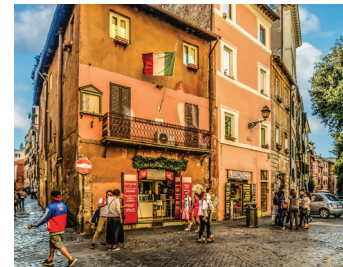
Streets of Rome

Breakfast at hotel and day at leisure. Optional tours in the city or to Naples and Pompeii are available. Overnight in Rome.