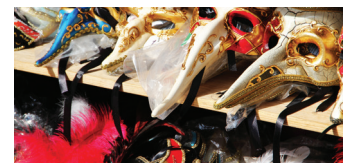
Left-to-right: Milan; Colosseum in Rome; Carnevale Masks, Venice