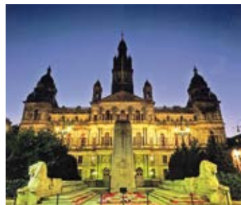
Glasgow City Council