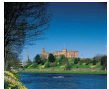
Inverness Castle