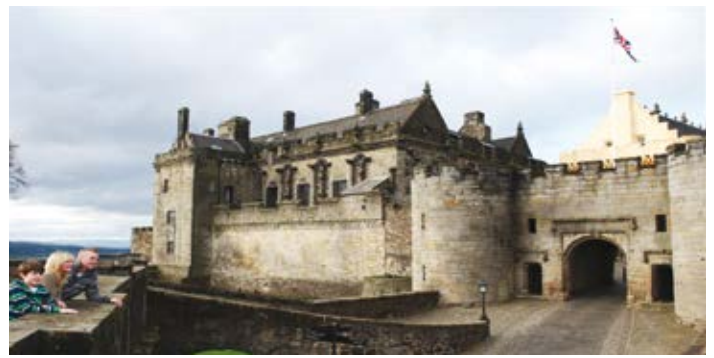
Left to right: Urquhart Castle, Inverness; Stirling Castle, Stirling

GLASGOW – EDINBURGH: 10 Days | 9 Nights | 9 Breakfasts | 8 Dinners