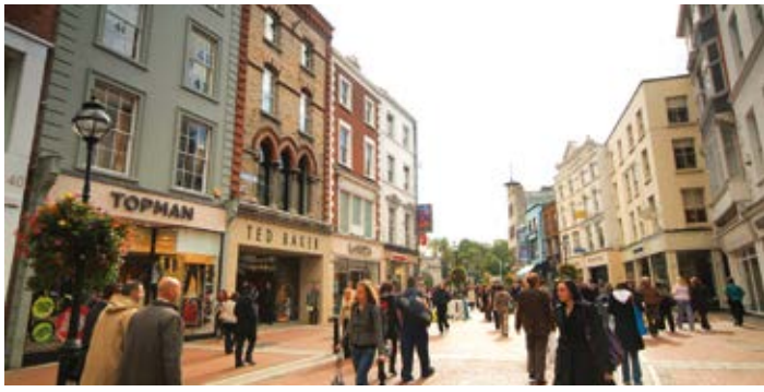
Left to right: Grafton Street, Dublin; Kelvingrove Museum, Glasgow

DUBLIN – EDINBURGH: 8 Days | 7 Nights | 7 Breakfasts | 6 Dinners