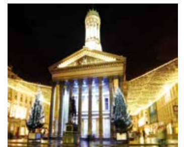
Gallery of Modern Art, Glasgow