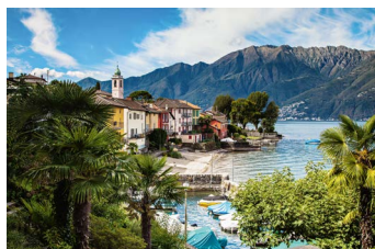
Ticino region