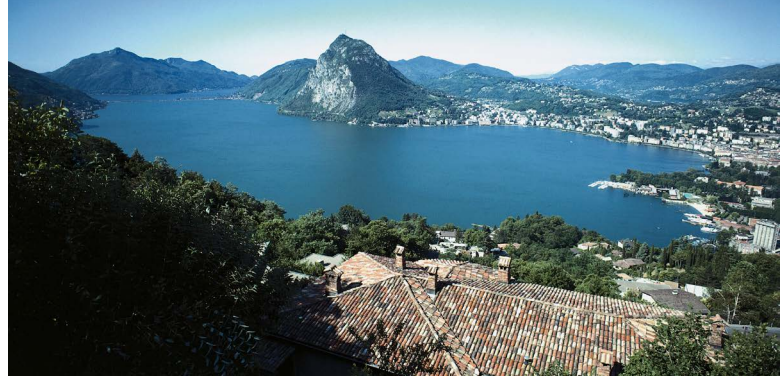
Left-to-right: Lucerne, Mt Pilatus Cogwheel railway, Lugano