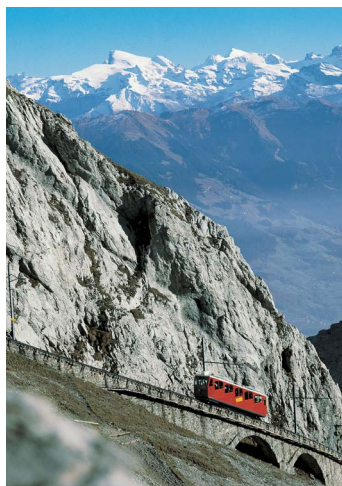
Mt Pilatus Cogwheel railway