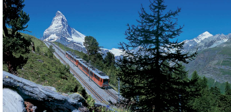
Left: Rotair Gondola at Mt Titlis; Right: Gornergratbahn with views of the Matterhorn;