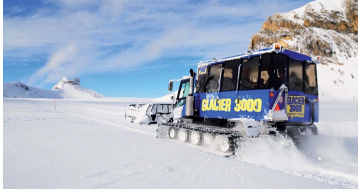
The top of the 2132 m high Mt. Pilatus. Right: Glacier 3000 Snow Bus Experience