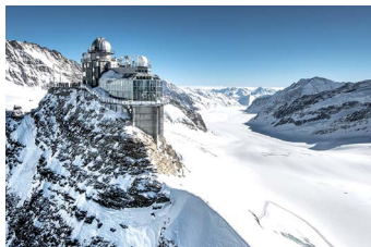
Sphinx Observatory, Jungfrauoch

After breakfast, depart Lucerne by train to Swiss border or international airport rail station or extend your stay in Switzerland. (B)