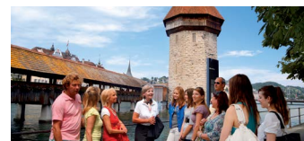
Group in front of the Kapellbrücke, Lucerne

Depart Interlaken for Swiss border or airport rail station or alternatively continue your stay in Switzerland. (B)