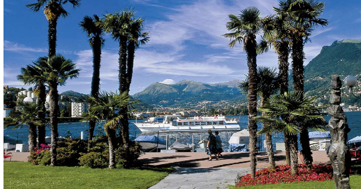
Left-to-right: Montreux, Madonna del Sasso Sanctuary, above Locarno, Lugano