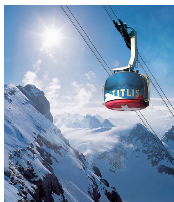
Rotair Mt Titlis, Engelberg