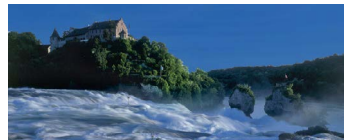
Rhine Falls

Excursion to Mount Titlis – at 3,020 m. From Lucerne the train takes you to the mountain monastery village of Engelberg where you board a gondola, which takes you up to the Trübsee. Continue your trip by another gondola to Stand and finally the revolving Titlis Rotair cablecar takes you up to Mount Titlis. For a spectacular, close-up insight into a glacier, visit the glacier cave and ride the Ice Flyer chairlift. Discover everything Mt Titlis has to offer on this wonderful excursion! Overnight in Lucerne.