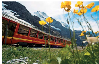
Train to the Jungfrauoch