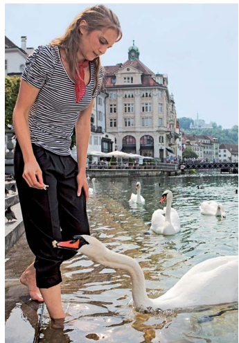
Swans near the Water bridge, Lucerne