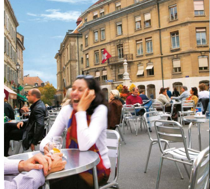
Left-to-right: Enjoying a drink in Zurich © swiss-image.ch; Bern © swiss-image.ch; Old town in Geneva © swiss-image.ch