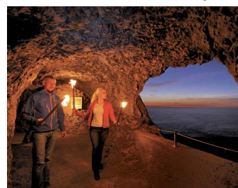
Mt. Pilatus