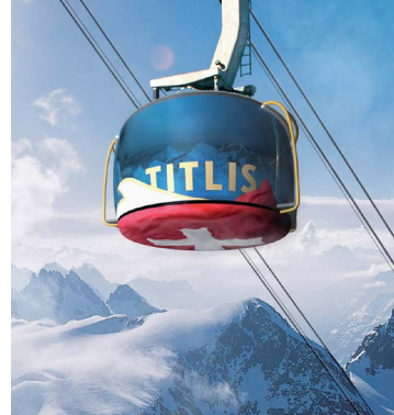
Left to right: Mt Rigi conductor; Glacier Express; Mt Titlis Rotair