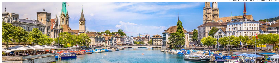
Zurich and the Limmat River