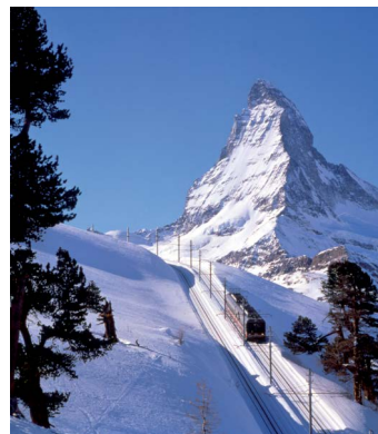
Gornergrat Bahn with the Matterhorn