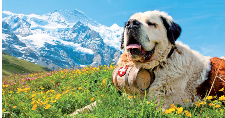
Left: Rhaetian Railways; Right: St Bernard known as a Swiss Mountain Dog - the earliest written records of the breed are from monks at the hospice at the Great St Bernard Pass in 1707.