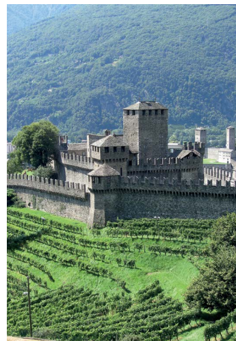
Montebello Castle, Bellinzona – capital of Canton Ticino