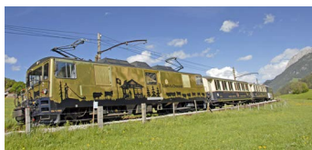
Chocolate Train, Montreux

Mon – Thu: 1 May – 30 Jun 2017. Mon, Wed & Thu: 1 Sep-12 Oct 2017. Daily: 1 Jul - 31 Aug 2017.