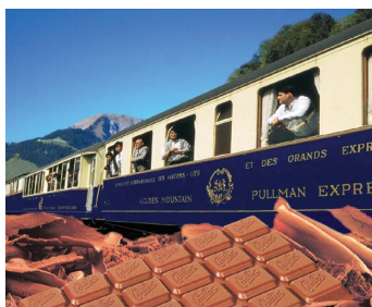
Chocolate Train, Montreux