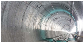
Gotthard Base Tunnel