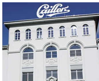
Nestlé/Cailler Chocolate factory