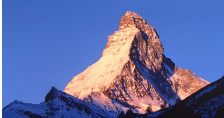
Left-to-right: St Moritz; The Matterhorn