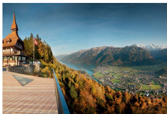
View of Interlaken from Harder Kulm

Today is at your leisure. Interlaken is located between the lakes of Thun and Brienz, at the foot of the towering trio of the Eiger, Mönch and Jungfrau. At about 6:00 p.m. meet with your guide in the lobby for a talk about the coach tour starting the following morning. Overnight at first-class hotel. (B)