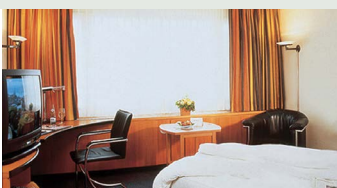
Swissotel International Zurich-Oerlikon, Room