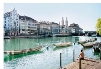
Left-to-right: Zurich at Night; Zurich by the River