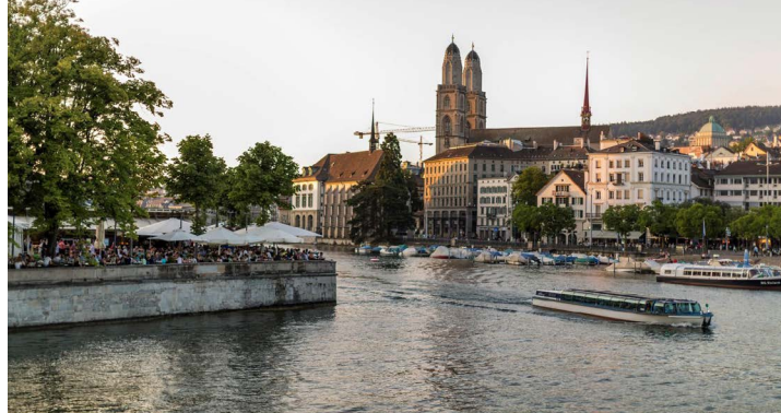
Left: Zurich on the Banks of River Limmat, Right: Zurich at Dawn