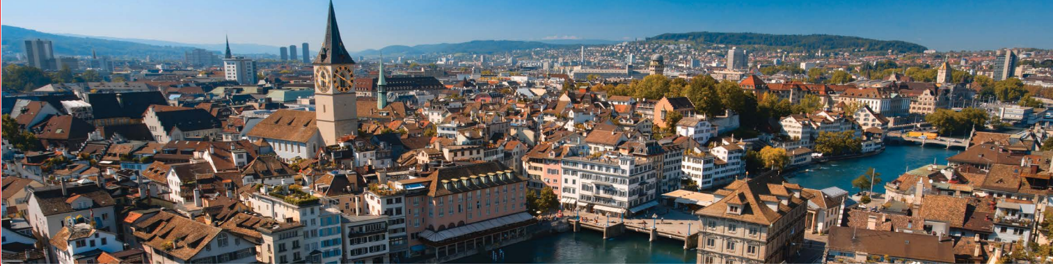
Zurich on the River Limmat