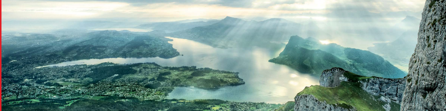
View of Lucerne from Mt. Pilatus