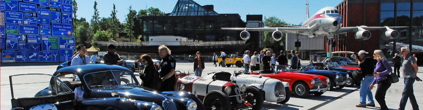
Swiss Transport Museum