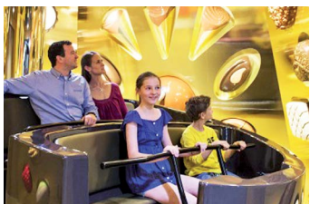
Above: Images of Swiss Chocolate Adventure

The Swiss Museum of Transport has a new attraction. A multimedia theme world, the Swiss Chocolate Adventure, developed in conjunction with the Lindt Chocolate Competence Foundation, opened in June 2014. This new experience shows you interesting facts about the origin, production and transport of chocolate. It illustrates the entire value creation and transport chains from the cultivation of the cocoa bean and the transport to Switzerland up to the manufacture and sale of the finished chocolate product.