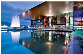
Lucerne Congress Centre