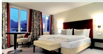
Hotel Krebs, Bedroom

This traditional hotel is located in the centre of Interlaken, close to the Interlaken West train station. All rooms are modernly furnished. The restaurant serves Swiss specialities and from the terrace you can enjoy superb views of the mountains of the Bernese Oberland.