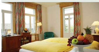
Hotel Carlton-Europe, Bedroom

Centrally located, 200m from Interlaken East Railway Station at the quiet end of Höheweg, Interlaken's famous high street. 75 uniquely-furnished rooms all with private facilities, radio, TV, telephone, hairdryer and wireless internet connection.