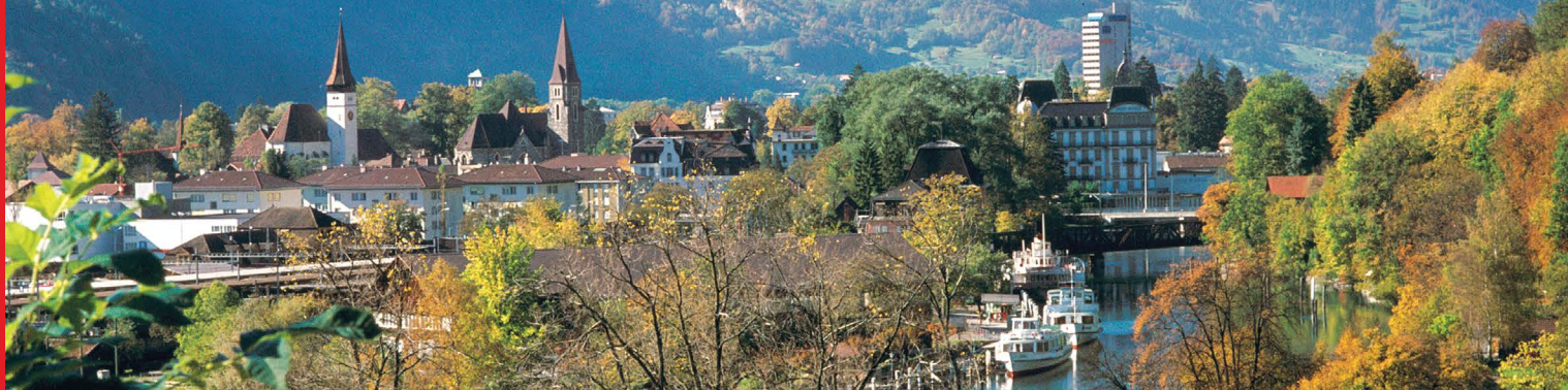
Autumn in Interlaken