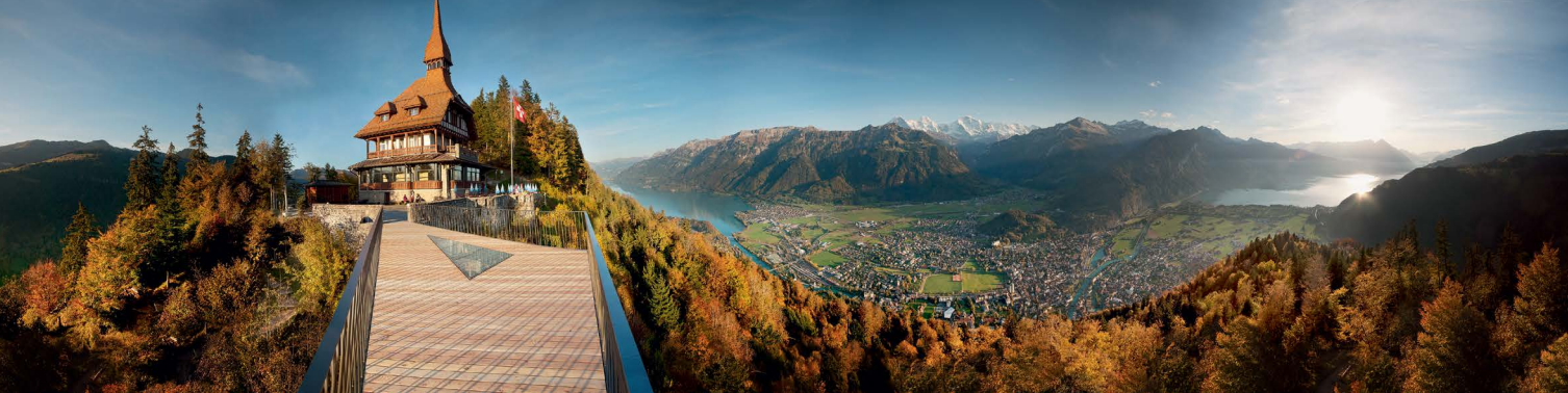
View over Interlaken from Harder Kulm lookout and Panorama Restaurant