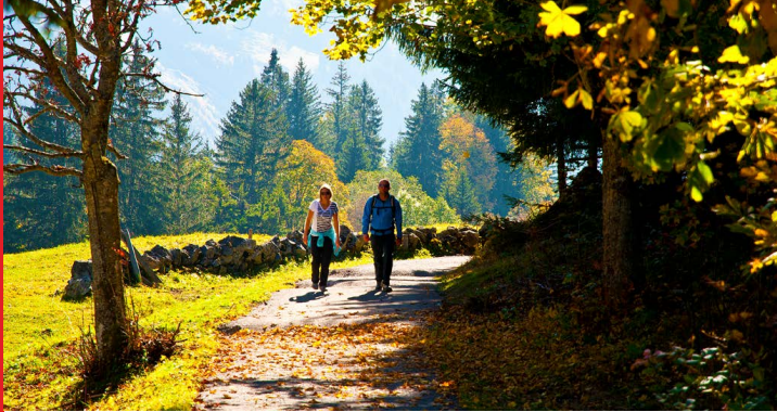
Left-to-right: Hiking Bort to Grindelwald; Eiger panorama