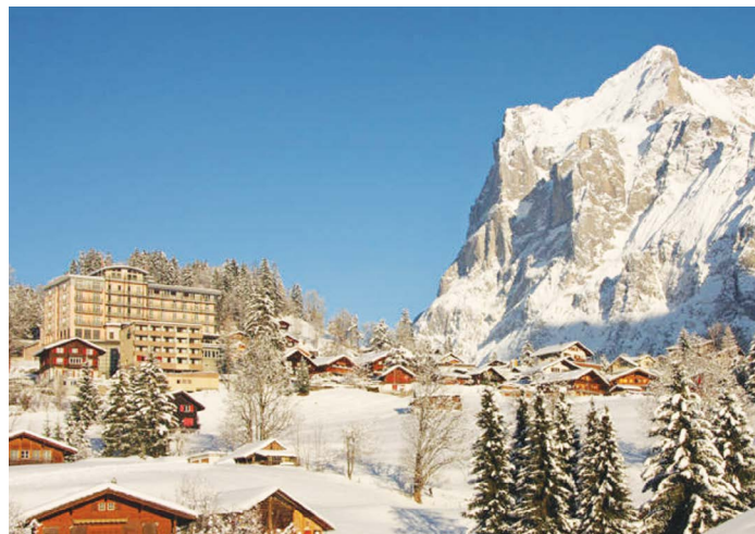
View of the Belvedere Swiss Quality Hotel, Grindelwald

PRICES FROM $202 per person per night, low season, twin share