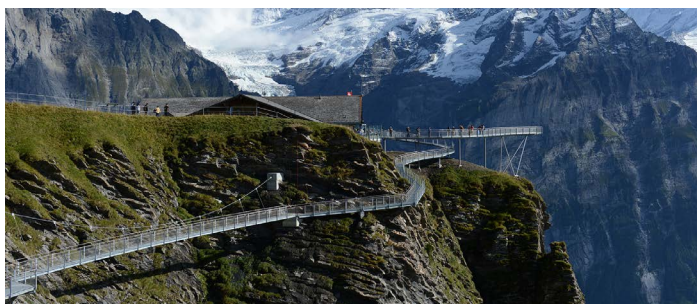
First Cliff Walk