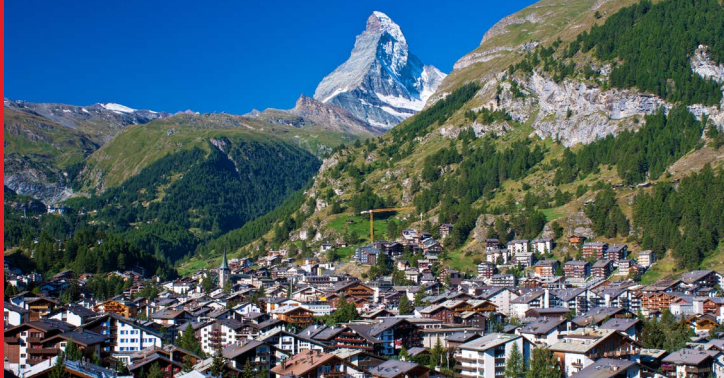
Zermatt by summer day and winter night