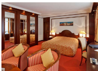
Classic double room

PRICES FROM $188 per person per night, low season, v twin share