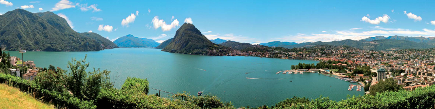
View of Lugano