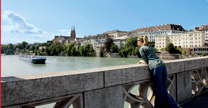
Left-to-right: Basel on the Rhine River; Freiburg Minster; Strasbourg