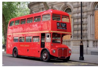
Double Decker Bus, London