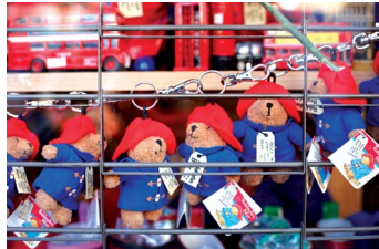
Paddington bear toys at Portobello Market