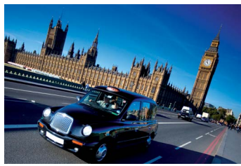
The Houses of Parliament, London