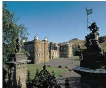
Palace of Holyroodhouse, Edinburgh