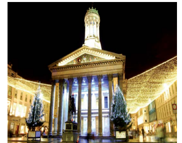
Gallery of Modern Art, Glasgow