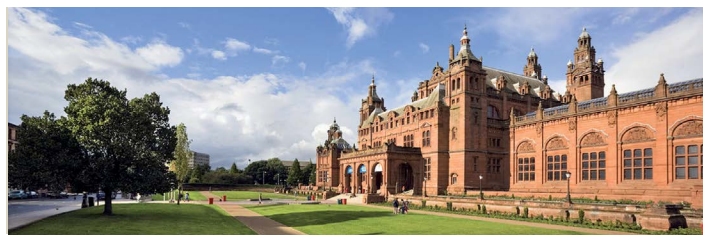
Left to right: Grafton Street, Dublin; Kelvingrove Museum, Glasgow