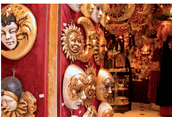
Carnivale Masks in Venice,

PRICES FROM $225 per studio, per night, low season, sleeps 1-2 people