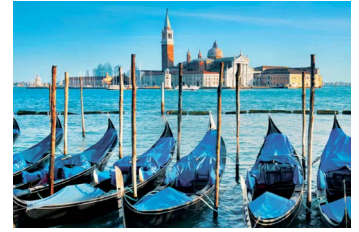
Left-to-Right: Eiffel Tower, Paris; Trevi Fountain, Rome; Galleria Vittorio Emanuele II, Milan; Gondolas in Venice