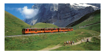
Jungfrau railway train