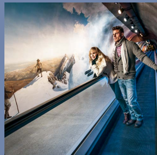
Ice Palace at Jungfraujoch