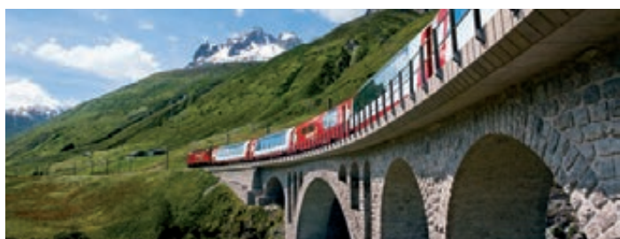
Glacier Express

Day 1 | Arrive St. Moritz Travel by train in 1st class from Zurich or Geneva airport/railway station or from any Swiss border to St. Moritz. Overnight in St. Moritz.