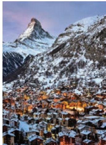
Matterhorn from Zermatt

Your choice of 2 or 3 nights; 3, 4 or 5 star hotels and lunch on board the famous Glacier Express.