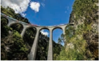
Glacier Express