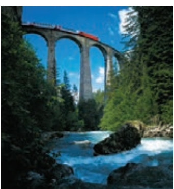
Glacier Express