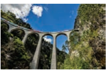
Glacier Express