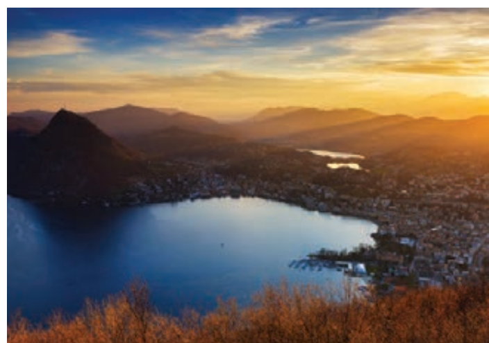
Lake Lugano