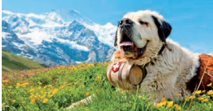
Left: Rhaetian Railways; Right: St Bernard known as a Swiss Mountain Dog - the earliest written records of the breed are from monks at the hospice at the Great St Bernard Pass in 1707.