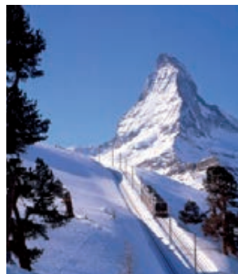
Gornergrat Bahn with the Matterhorn