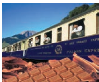
Nestlé/Cailler Chocolate factory