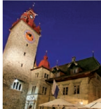
Above: Lucerne

Day at leisure. We recommend an optional excursion to any of the following mountain tops: Mount Pilatus, Mount Rigi or Mount Titlis. Overnight in Lucerne. (B)