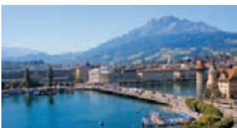
Lucerne and Mt Pilatus

The GoldenPassLine train takes you through mountain villages to the Bernese Oberland. Overnight in Interlaken. (B)