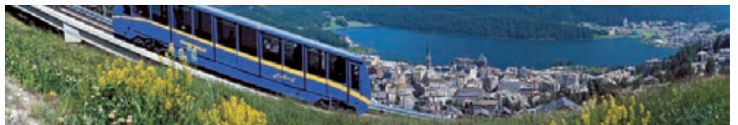
View over St. Moritz