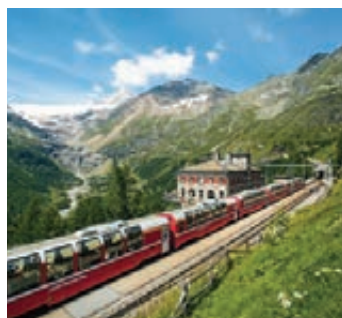
Bernina Express © Swiss Travel System;