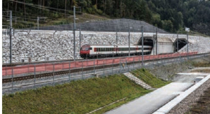
Left-to-right: Bernina Express © Swiss Travel System; Gotthard Express © Swiss Travel System