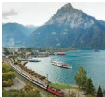
Gotthard Express