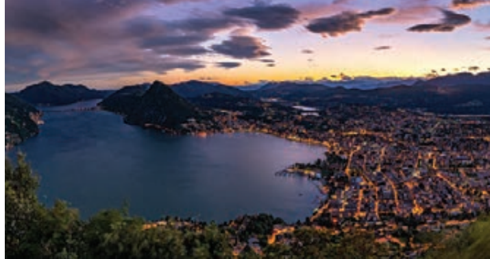
Left-to-right: St Moritz © swissimage.ch; Lugano © swissimage.ch