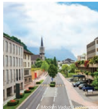
Modern Vaduz, Liechtenstein

As the tour ends late in the day, consider pre-booking a night in Zurich or other arrangements.