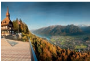
View of Interlaken from Harder Kulm

Today is at your leisure. Interlaken is located between the lakes of Thun and Brienz, at the foot of the towering trio of the Eiger, Mönch and Jungfrau. At about 6:00 p.m. meet with your guide in the lobby for a talk about the coach tour starting the following morning. Overnight at first-class hotel. (B)