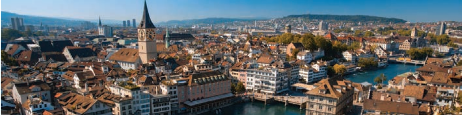
Zurich on the River Limmat