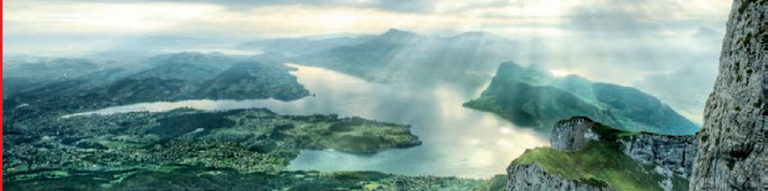
View of Lucerne from Mt. Pilatus