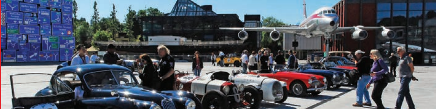
Swiss Transport Museum