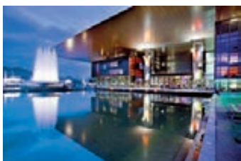
Lucerne Congress Centre