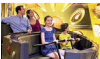
Above: Images of Swiss Chocolate Adventure

The Swiss Museum of Transport has a new attraction. A multimedia theme world, the Swiss Chocolate Adventure, developed in conjunction with the Lindt Chocolate Competence Foundation, opened in June 2014. This new experience shows you interesting facts about the origin, production and transport of chocolate. It illustrates the entire value creation and transport chains from the cultivation of the cocoa bean and the transport to Switzerland up to the manufacture and sale of the finished chocolate product.