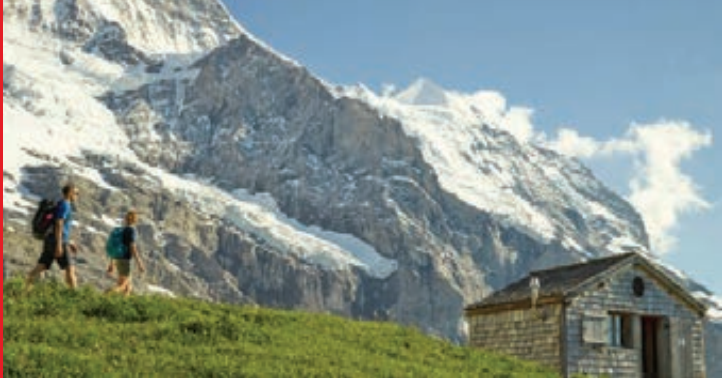
Left-to-right: Eiger Walk in Summer; Schynige Platte - Walking to Oberberghorn