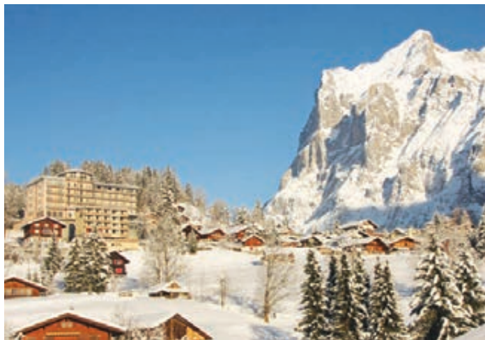
View of the Belvedere Swiss Quality Hotel, Grindelwald

PRICES FROM $255 per person per night, low season, twin share