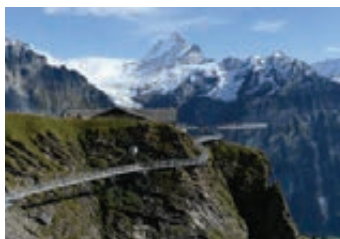
First Cliff Walk