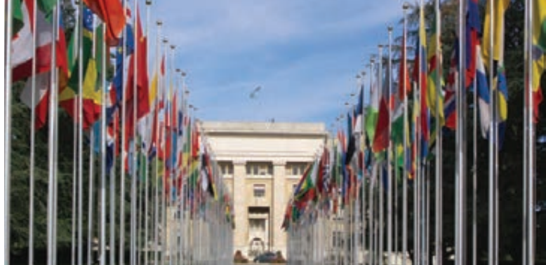
Left-to-right: Cathedral of Notre Dame of Lausanne; UN, Geneva