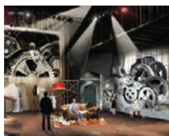
The Studio and The Manoir The Studio

in Corsier / Vevey (take Bus #212 from Vevey Station)