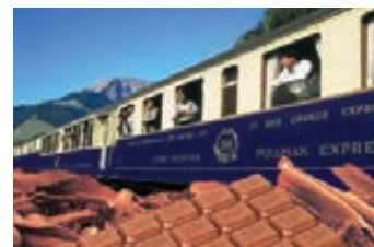
On board the Chocolate train

Ride in first-class comfort in a 'Belle Époque' Pullman car, vintage 1915, or the modern panorama car affording stunning views of the vineyards surrounding Montreux and medieval Gruyères. Depart Montreux on the Swiss Riviera, ascend to Gruyères, home of Gruyère cheese, and continue to Broc, where the chocolate factory is located. Refer to page 19 for further details.