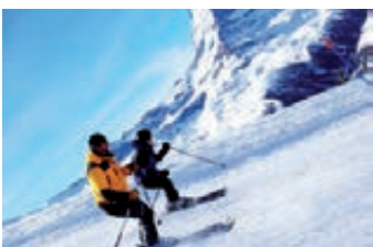
Skiing in Zermatt, near the Matterhorn