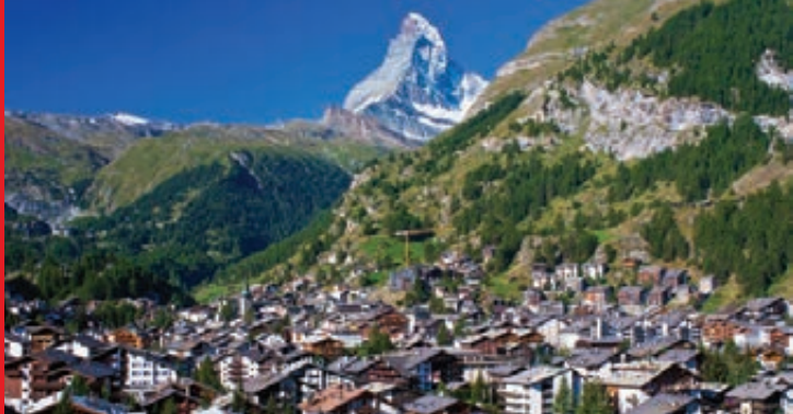
Zermatt by summer day and winter night