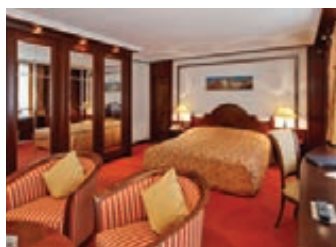
Classic double room

Located in the heart of the village. 400 metres from the railway station. Offering 66 luxurious rooms with wellness facilities and free Wi-Fi. Restaurant, piano bar and a lounge with a mountain-view terrace. The spa offers an indoor pool, 2 hot tubs and a sauna, plus Matterhorn views.