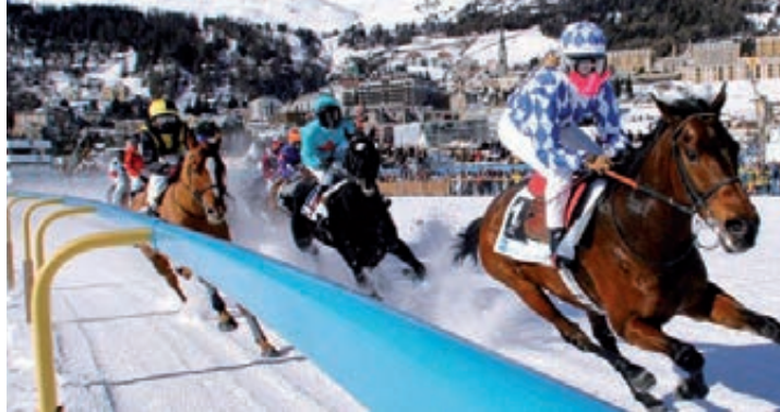
Left-to-right: St. Moritz from the lake; White Turf St. Moritz - International Horse Race on Snow since 1907