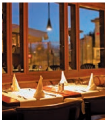
Hotel Hauser, Restaurant Hauser Chocolate Shop

Grisons-style barley soup, followed by 'Pizokels' dumpling with diced vegetables, slices of air-dried beef, onions and melted cheese. 200ml of house-wine and still or sparkling: 'St. Moritz' table-water.