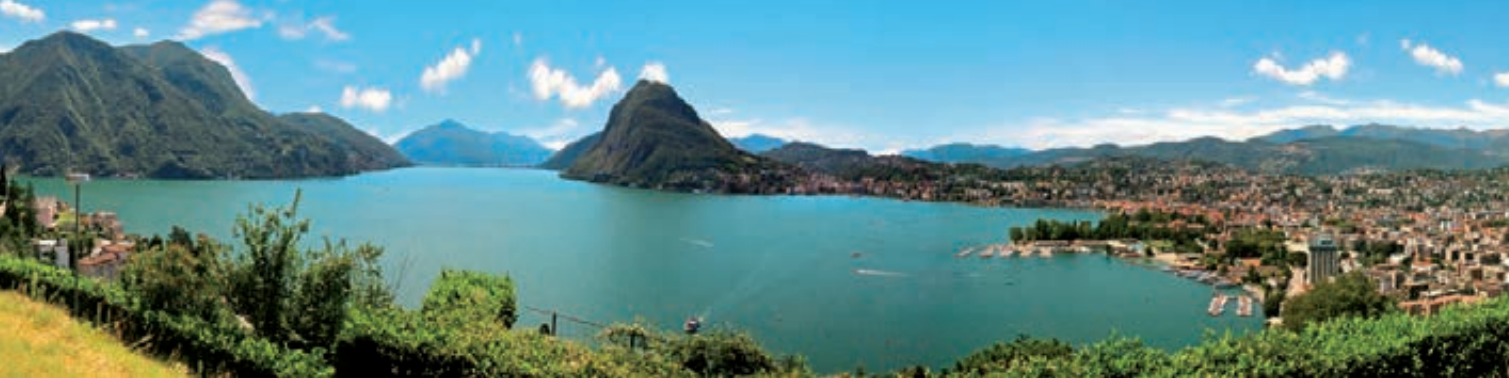
View of Lugano