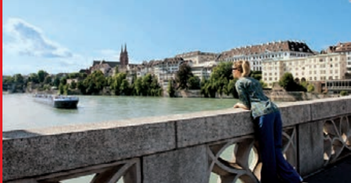
Left-to-right: Basel on the Rhine River; Freiburg Minster; Strasbourg