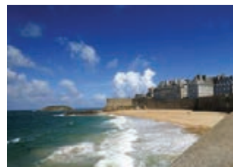
St. Malo © Yannick Le Ga