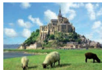
From left: Arc de Triomphe; The Louvre ; Reims vineyard; Mont Saint Michel