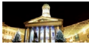
Gallery of Modern Art, Glasgow