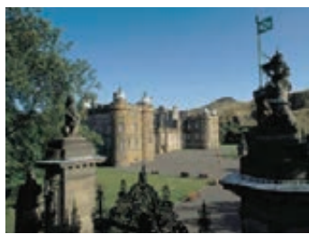
Palace of Holyroodhouse, Edinburgh