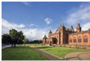
Left to right: Grafton Street, Dublin; Kelvingrove Museum, Glasgow