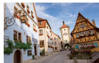
Left-to-right: Alte Opera, Frankfurt; Berlin; Würzburg; Rothenburg ob der Tauber