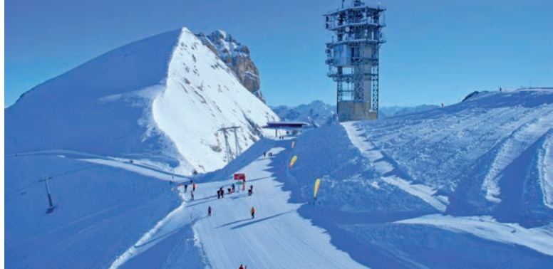
Mt Titlis